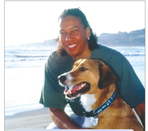
Dawn watched Jacques Cousteau explore the seas on TV every week when she was young.